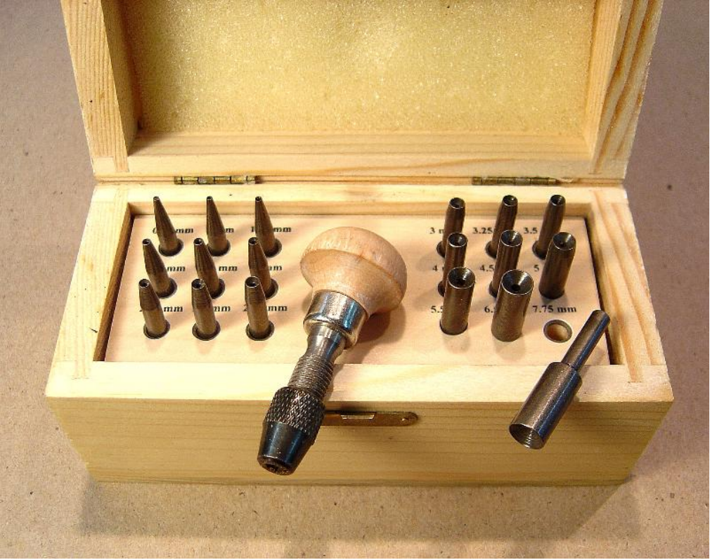
Specially made for those pesky small bezels.