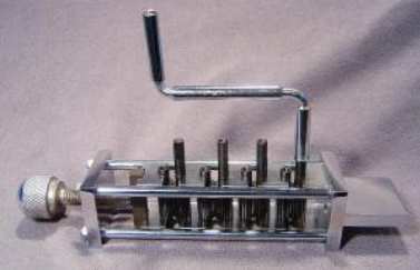
Make your own decorative corrugations in soft metal as shown in the May-June 2011 issue of Lapidary Journal Jewelry Artist . Complete with four pairs of rollers. Clamps into your bench vise.