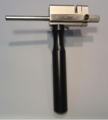
Compact, well-made tube cutting jig with handy measure.